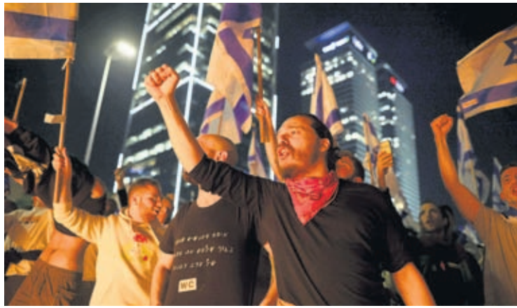
Israelis opposed to Prime Minister Benjamin Netanyahu's judicial overhaul plan block a highway during a protest moments after the Israeli leader fired his defense minister, in Tel Aviv, Israel, Sunday, March 26, 2023. Defense Minister Yoav Gallant had called on Netanyahu to freeze the plan, citing deep divisions in the country and turmoil in the military.

Demonstrations took place in Beersheba, Haifa and Jerusalem, where thousands of people gathered outside Netanyahu's private residence. Police scuffled with protesters and